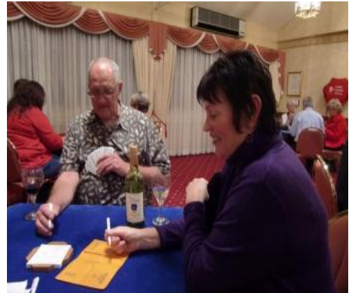
The only way to play (wine at hand)