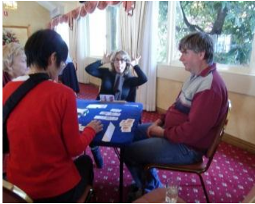
Not so serious play