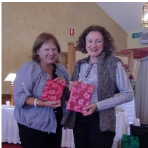
Pink Rose girls