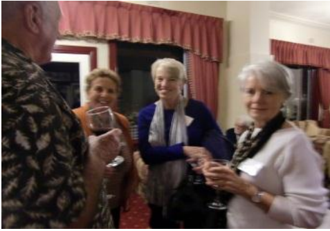
1 st night drinks