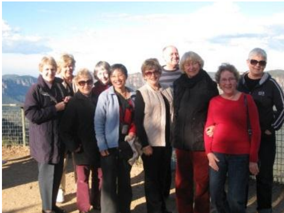
The intrepid walkers