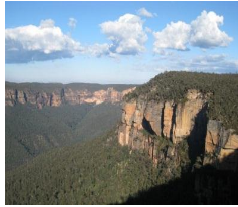
The view from Govetts Leap