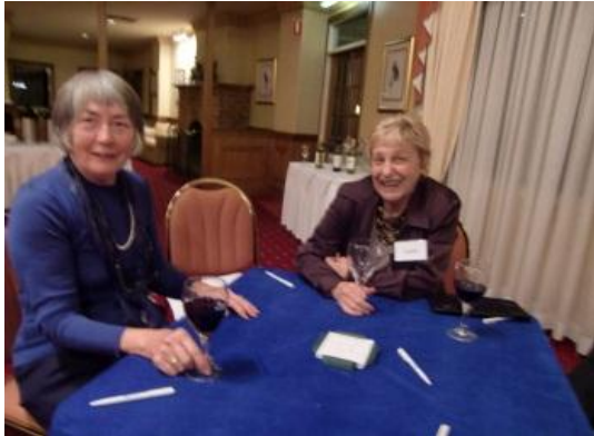
Ready for the evening play

When you check the results you can see that some people play better when the way is smoothed with a little alcohol ... others perhaps don't.