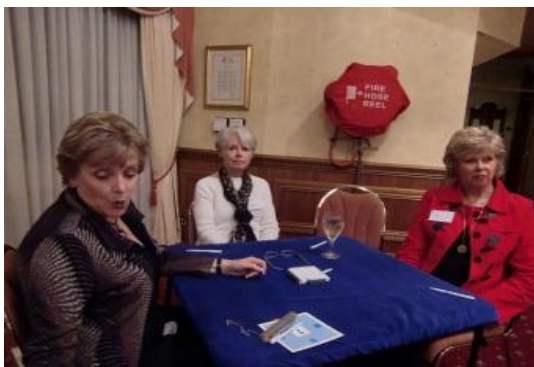
Ooh ... what did I drop?

There were some major shifts in the placings which added a little frisson to the Blue Mountain Pairs held on Sunday morning.