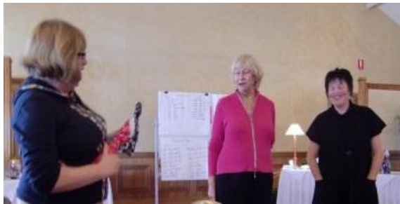
Good time gals award