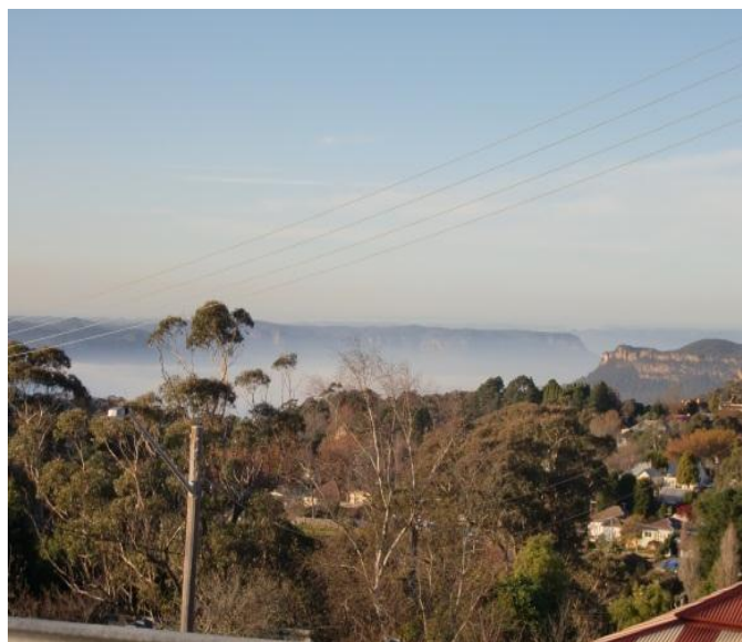
Early morning view of the Jameson Valley – filled with mist

The lounge and many of the rooms afforded glorious views of the Jameson Valley where the sandstone changed colour a dozen times in the course of the day. However playing bridge was the reason for the weekend and play bridge we did.